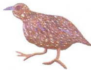
Painted Button Quail