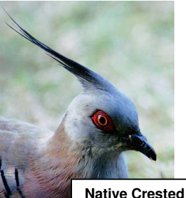
Native Crested Pigeon

While Spotted Doves are not a target species for our group, we would be interested in hearing from CIMAG members and friends whether they are seeing them around their way. Also, while they are not likely to enter our traps as we use dry dog or dry cat food, if by chance you do get one in the trap, you can dispose of it humanely like the Indian Myna and Starling. But please be very careful that it is not our native Crested Pigeon.