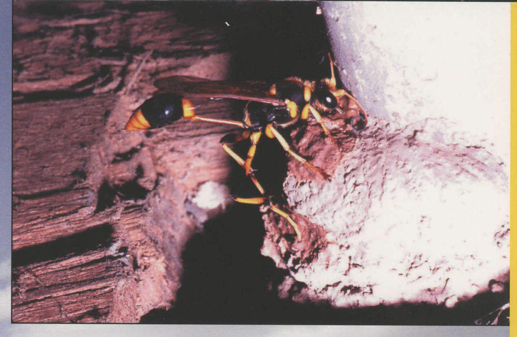
Mud dauber wasp building its nest

Because of high densities and their insect-foraging activities, European wasps can destroy virtually all insect species in an area with up to 100kg of insect and spider prey per year captured by foragers for a single overwintering nest.