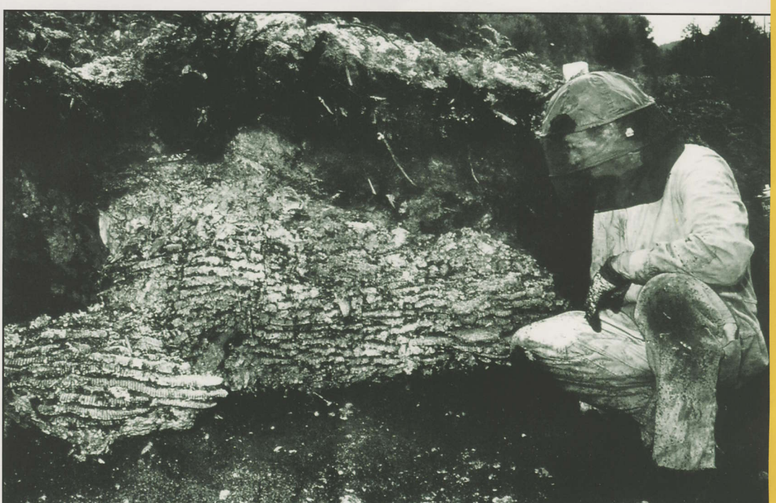
Large European wasp nest (Tasmania)

Once found and confirmed by phoning the European Wasp Hotline, wasp nests are best destroyed by a professional pest controller. If you attempt to destroy a nest without suitable experience and protective clothing, be warned – European wasp nests in Australia can be twice as big, with many times more worker wasps, than their counterparts in Europe!